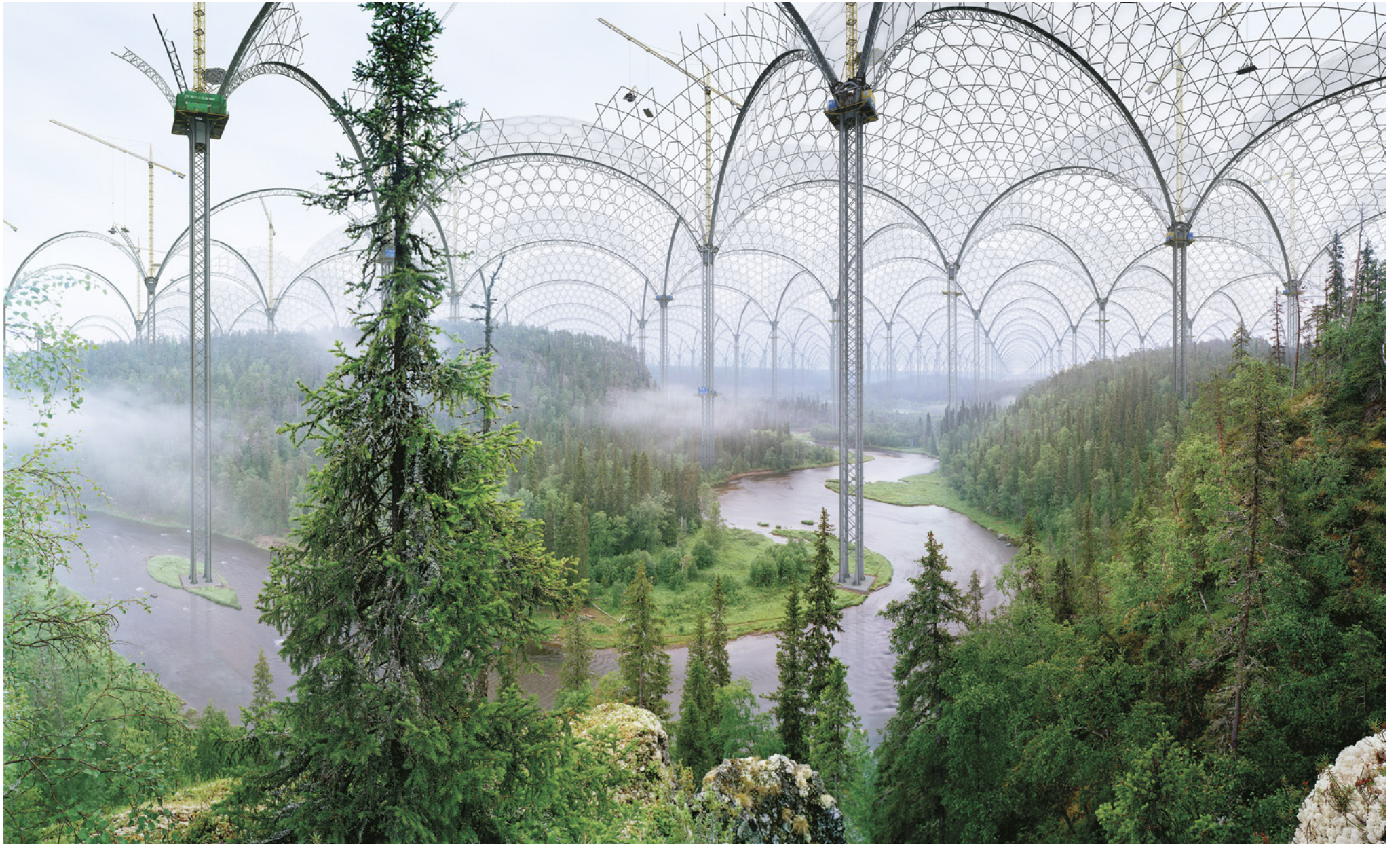
Kitka-river, 2004 (triptych)